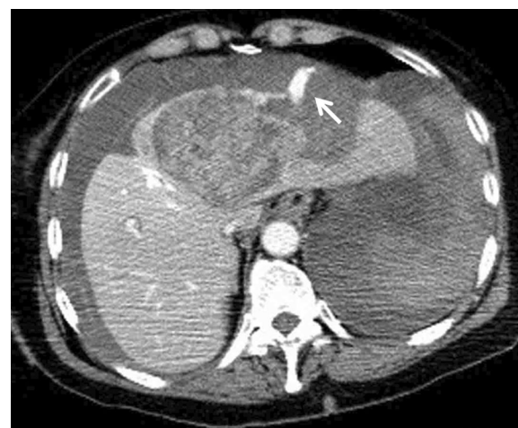
Fig. 1 Findings of CT on arrival at the hospital. Dynamic contrast-enhanced CT scan showing extravasation of contrast medium from the ruptured tumor in the medial segment of the liver and a large amount of high-density intra-abdominal fluid collection

TAE was performed to control the bleeding from HCC rupture. No tumor staining was observed on examination of the right hepatic artery. The left inferior phrenic artery (IPA) and the left hepatic artery branching from the left gastric artery were embolized. Hemostasis was achieved and blood pressure was elevated; however, the IAP was 27 mmHg. Then, abdominal puncture was performed, resulting in the drainage of 3000 ml from