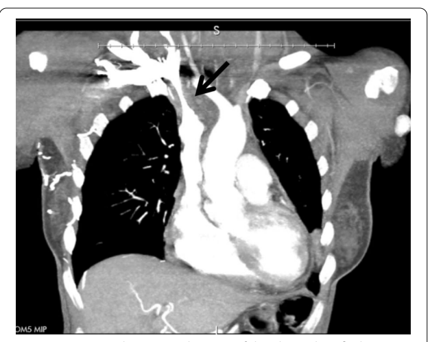
Fig. 1 A computed tomography scan of the chest identified significant mediastinal lymphadenopathy (arrow) that compressed the airway and the superior vena cava