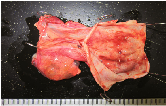
Fig. 3 Resection specimen. The diagnosis was cystic lymphangioma, and the histopathological findings showed the cystic tissue to be benign. The cytology (cyst fluid) was class II

present case was easy to perform and required no special materials.