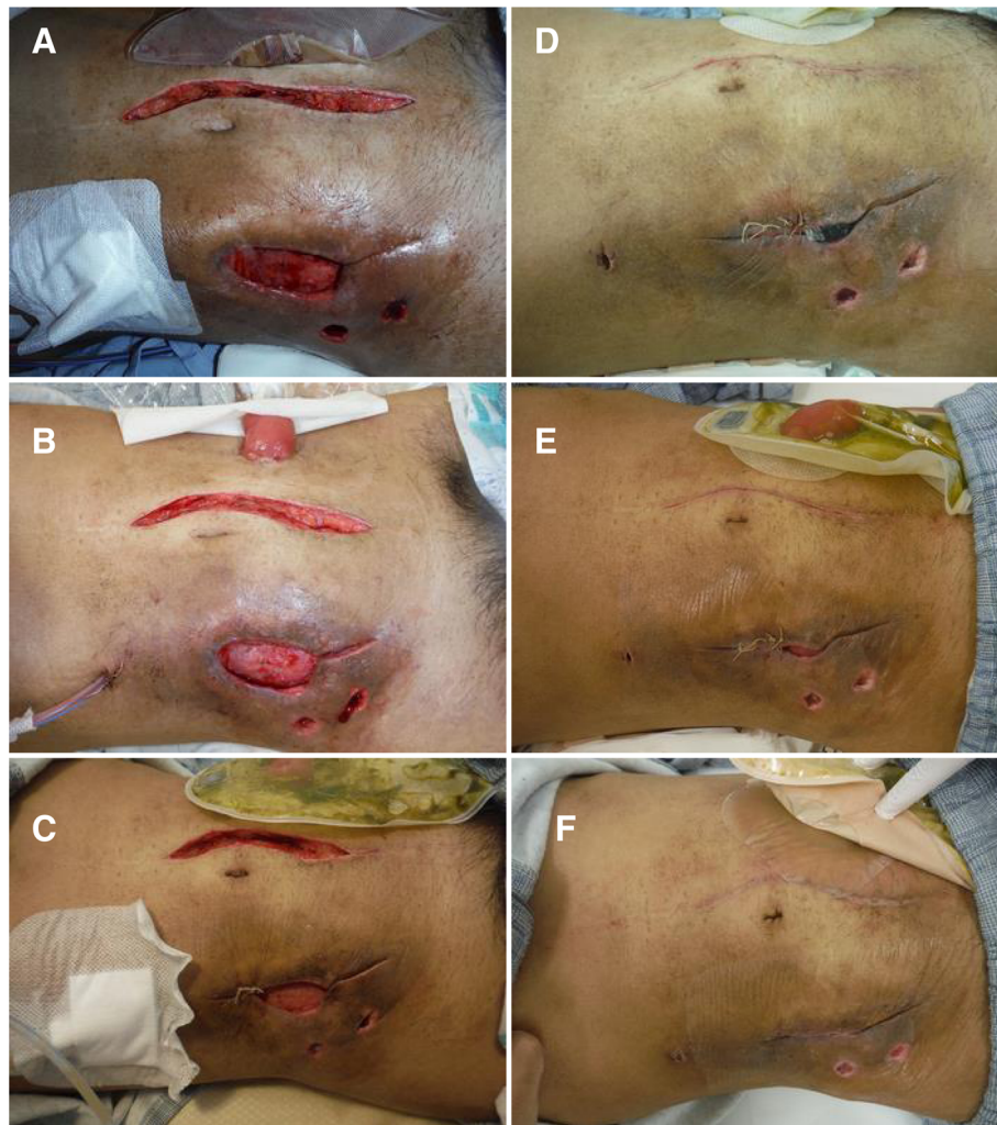
Fig. 2 Photographs of the wound. a NPWT was induced immediately after surgery. b POD 2. c POD 4. d POD 6. e POD 8. f The wound had closed completely on POD 14

primary skin closure, and surgeons need to respond promptly to troubles such as obstruction of the foam tube or bleeding. For the wound site is closed with dressing, once the bacteria proliferate in the wound site, the foam and drainage tube easily becomes obstructed and the condition of the wound site gets worse and this method rather promotes infection. In order to avoid complications, surgeons need to observe the wound site carefully and frequently. However, if appropriate countermeasures such as increasing the frequency of foam replacement are taken, these troubles can basically be overcome. In facilities that newly introduce NPWT, it is necessary to experience success cases with treatment for exudative wound and expand the indication gradually.