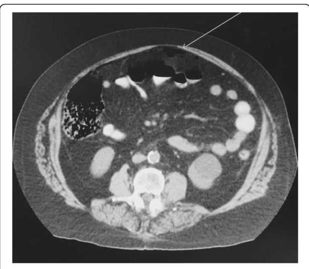
Fig. 1 CT scan of the abdomen. Pneumoperitoneum identified on CT scan of the abdomen