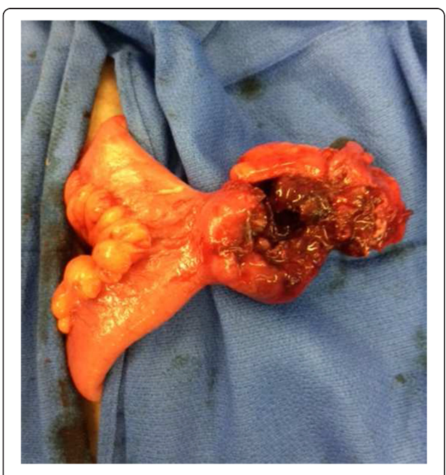
Fig. 2 Intraoperative image. Perforated Meckel's diverticulum

At exploratory laparotomy, we encountered a small amount of murky ascites and a perforated small bowel diverticulum on the anti-mesenteric side of the ileum (Fig. 2), approximately 50 cm from the ileocecal valve. In addition, a fibrous vitelline attachment was found between the diverticulum and the abdominal wall. Segmental small bowel resection with a primary anastomosis was performed. The peritoneal cavity was