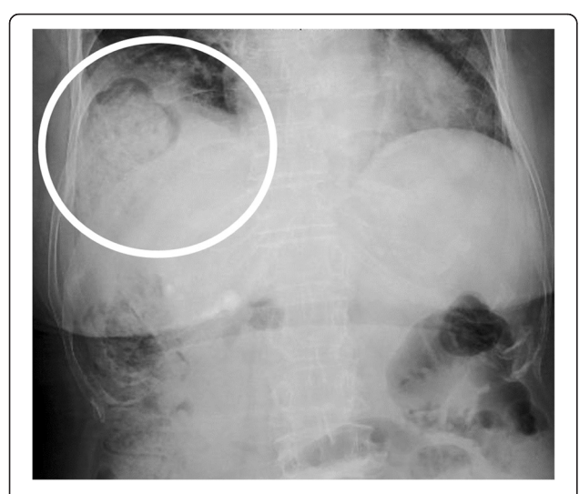
Fig. 1 Abdominal radiograph obtained at symptom onset, showing the deviation of the colon across the right diaphragm (white circle)

courses of RFA therapy targeting the recurring HCC, a sudden, strong right upper abdominal pain and dyspnea occurred in 2015. The last RFA therapy session was performed 15 months before the symptom onset. Abdominal radiography revealed a massive abnormal free air on the right side under the diaphragm (Fig. 1). Hence, the patient was transferred to our hospital under the suspicion of acute abdomen. The vital signs were not remarkable as follows: blood pressure, 136/ 90 mmHg; pulse rate, 107/min; and SpO<sub>2</sub>, 96 % (room air). In a physical examination, acute pain was found in the right hypochondrium. Laboratory findings did not demonstrate any abnormalities, including white blood cell count or C-reactive protein level. Chest radiograms showed lower right pulmonary opacity and left mediastinal shift. Contrast-enhanced CT