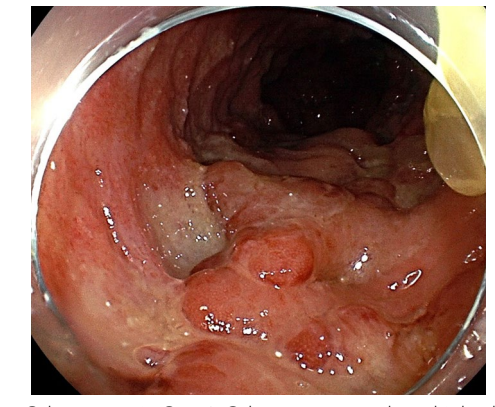
Fig. 4 Colonoscopy in Case 3. Colonoscopy reveals multiple ulcers throughout the entire colon

closed. No recurrence of intestinal BD has been identified postoperatively.