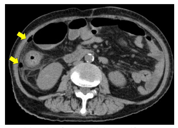
Fig. 1 Abdominal CT of Case 1. Wall thickening and free air around the ascending colon are seen. Perforation of the ascending colon was suspected

TNF\alpha : anti-TNF alpha antibodies; PSL: prednisolone, IL-1 \beta : anti-interleukin-1 beta antibodies