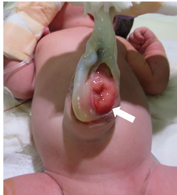
Fig. 2 The appearance of bladder evagination and small omphalocele. White arrow shows bladder mucosa

and we estimated that there would be low risk for hernia incarceration. So we planned the surgery for omphalocele with bladder evagination 1 day after birth.