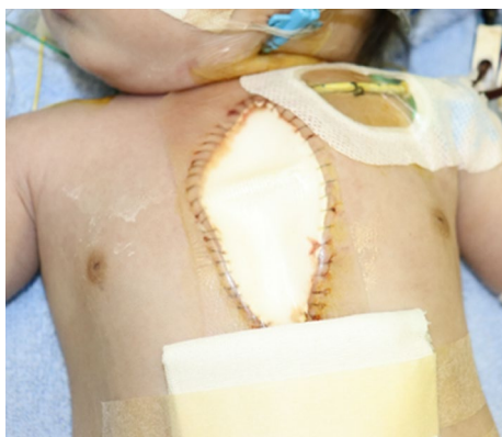
Fig. 1 A hydrocolloid wound dressing was applied to entirely cover the wound and the suture line

ECC, extracorporeal circulation; AoX, aortic cross clamp; SS, sternal splintage; TGA, transposition of the great arteries; CoA, coarctation of the aortic arch; PDA, patent ductus arteriosus; HLHS, hypoplastic left heart syndrome; TAPVC, totally anomalous pulmonary venous connection; PVO, pulmonary venous obstruction; RV, right ventricle; DORV, double outlet right ventricle; PA, pulmonary artery; CAVV, common atrio-ventricular valve; ASD, atrial septal defect; LV, left ventricle; TR, tricuspid valve regurgitation; MR, mitral valve regurgitation; SAS, subaortic stenosis; ASO, arterial switch operation; ECMO, extracorporeal membrane oxygenation; DKS, Damus-Kaye-Stansel; BDG, bidirectional Glenn procedure