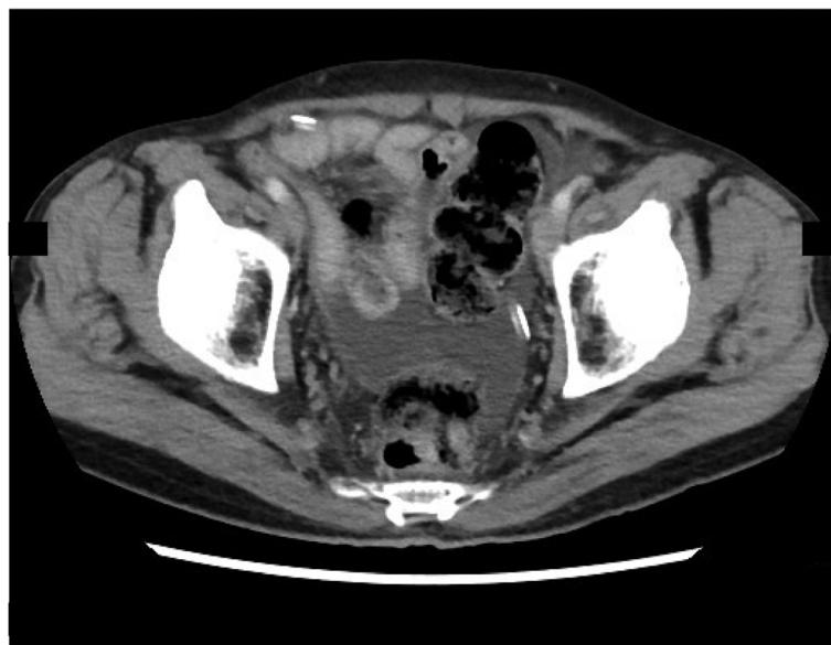
Fig. 3 Contrast-enhanced computed tomography image after combination chemotherapy showing decreased ascites in the pelvic cavity

Despite some progress in systemic chemotherapy [5–8], the median survival time (MST) of advanced/metastatic gastric cancer has still remained poor. PM of gastric cancer has been the most difficult pathology to detect and treat, with its prognosis being extremely poor. Moreover, given that patients with PM rarely have measurable lesions, only a few clinical trials have targeted patients