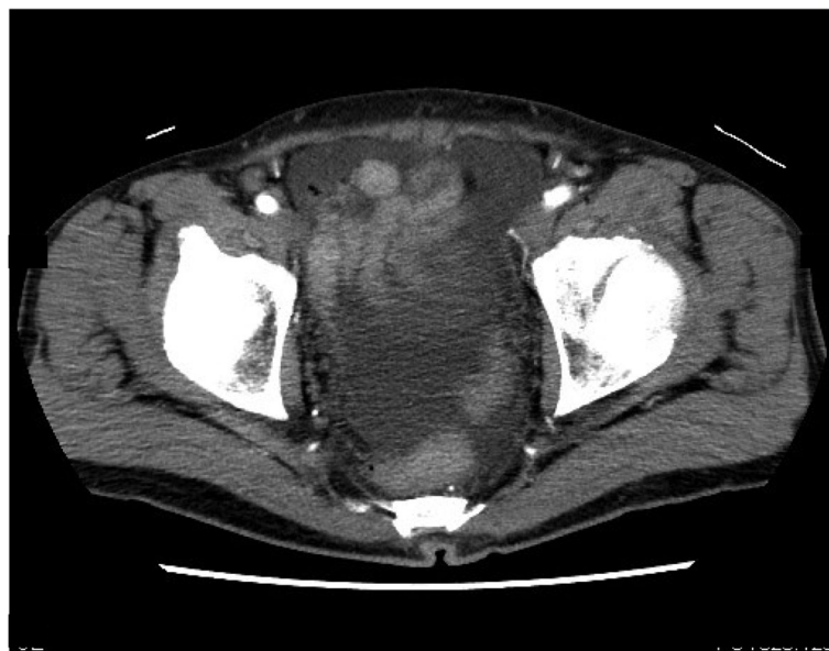
Fig. 1 Contrast-enhanced computed tomography image before staging laparoscopy showing pelvic ascites

Staging laparoscopy (SL) was performed during which white nodules on the right lower abdominal wall (Fig. 2a) and ascites in the pelvic cavity (Fig. 2b) were observed. Histopathological examination of nodules revealed PM, whereas cytological examination of ascites revealed positive results for cancer cells. Accordingly, the patients were diagnosed with PR of gastric cancer with a peritoneal cancer index score of 2 [4]. During SL, an IP access port was subcutaneously implanted for subsequent IP chemotherapy. The patient was then started on combined chemotherapy with IP and IV administration of PTX and oral S-1 2 weeks after SL. Accordingly, 20 mg/m 2 of IP PTX and 50 mg/m 2 of IV PTX were administered on days 1 and 8, whereas 80