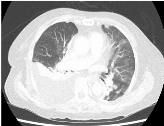
Fig. 2 Chest CT findings on POD 2. Right pleural effusion and bilateral pneumonia were confirmed by a chest CT

piperacillin hydrate, 13.5 g/day). The Na level was normal on POD 2 (143 mEq/L).