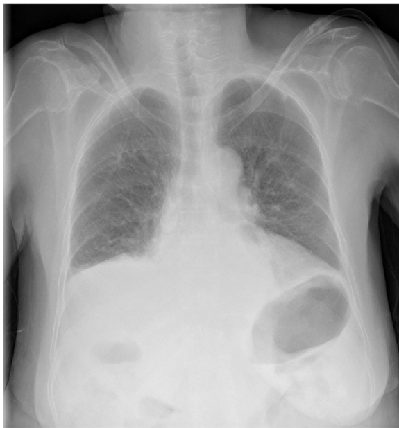
Fig. 3 Chest X-ray findings on POD 3. The right pleural effusion improved after tolvaptan administration, and no signs of pneumonia were found

On POD 4, at around 19:00, she showed disturbance of consciousness. We suspected that this condition was