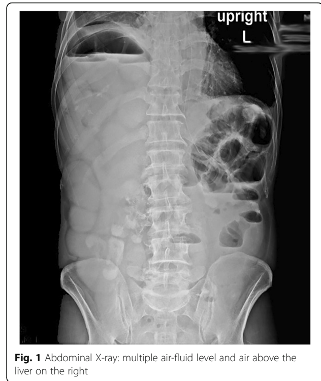
Fig. 1 Abdominal X-ray: multiple air-fluid level and air above the liver on the right