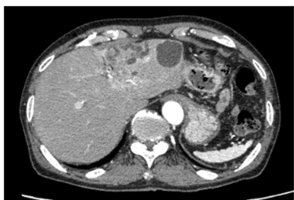
Fig. 1 Computed tomography images showing a tumor in segment 3 (yellow arrow). The peripheral bile duct branch of segment 3 was dilated

His laboratory findings on admission are summarized in Table 1 and included a platelet count of 3.5 \times 10^4/\mu\text{L} .