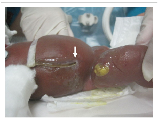
Fig. 3 Application of 2-octylcyanoacrylate (Dermabond®, Ethicon, Inc., Somerville, NJ) around the exit site of the tube was effective for stopping pericatheter leakage in PD. The arrow indicates the site of tube insertion

requiring revision or replacement, and in several case reports, bowel perforation. In our case, we did experience leakage of peritoneal fluid from the exit site, which did not impair PD efficacy. Because the skin of ELBW neonates is very thin due to the lack of subcutaneous fat tissue, firm fixation of the PD tube to the abdominal wall is difficult. In our case, pericatheter leakage was observed at the PD tube entry point. Application of 2-octylcyanoacrylate (Dermabond*, Ethicon, Inc., Somerville, NJ) around the exit site of the tube was effective in stopping this leak (Fig. 3).