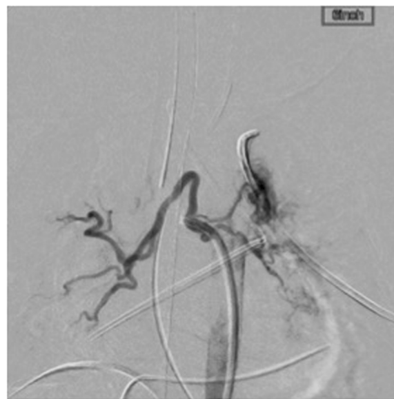
Fig. 1 An angiography image showing two aortopulmonary arteries connecting the descending aorta and the right pulmonary artery, and one collateral artery connecting the descending aorta and the left pulmonary artery

We reported the case of a baby girl treated with coil embolization for abnormal blood flow from the descending aorta to the pulmonary arteries after arterial switch operation. The occurrence of aortopulmonary collateral shunts after transposition of the great arteries is considered rare [3]. One of the possible reasons for overlooking collateral arteries is that the identification of collateral flow may be difficult as it can be obscured by the patent ductus arteriosus. However, large collateral