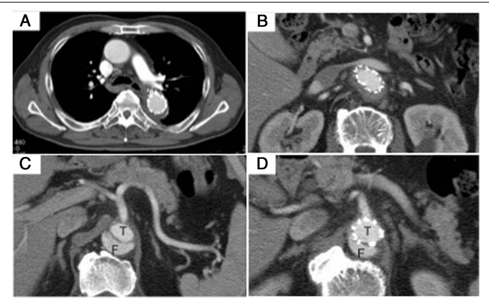
Fig. 2 Postoperative CT images of aorta at 6 months later. Compressions of the true lumen and the abdominal stent graft are improved. The false lumen is partially thrombosed without any dilatation of the false lumen. "F" indicates false lumen. "T" indicates true lumen. a CT image of thoracic aorta. b CT image of abdominal aorta. c CT image at the level of the celiac artery. d CT image at the level of the expanded previously abdominal stent graft (ENDURANT). Superior mesenteric artery (SMA) is shown with good contrast effects suggesting improved the blood flow of SMA

Implantation of the left leg with the abdominal stent graft was unable to improve the blood flow of the left lower limb. To increase the radial force, self-expandable nitinol stents (E-LUMINEXX and Epic) were implanted into the left leg, which successfully improved the blood flow of the left lower limb. Considering compression of the abdominal stent graft by dissection, there may be cases in which entry closure is insufficient treatment for type B dissection with CA, SMA, and leg obstruction. On the other hand, physicians should be attentive to the enlargement of dissection by implantation of stents.